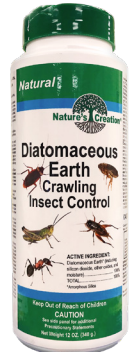
NC361 12 Oz. 8-13958-02361-4 NC363 10 lb. 8-13958-02363-8 NC 364 50 lb. 8-1398-02364-5