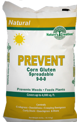
NC550 50 Lb. 8-13958-02550-2