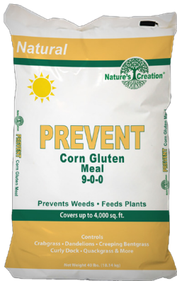
NC551 50 Lb. 8-13958-02551-9