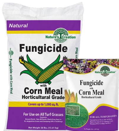
NC288 30 Lb. 8-13958-02288-4 NC286 4 lb. Bag 8-13958-02286-0