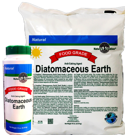
NC375 12 oz. NC377 10 lb. 8-13958-02375-1 8-13958-02377-5 NC358 50 lb. 8-13958-02358-4