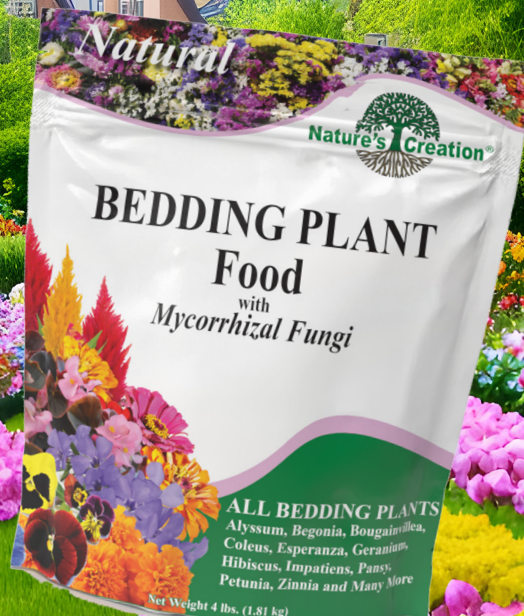
NC155 4 lb. 8-13958-02155-9