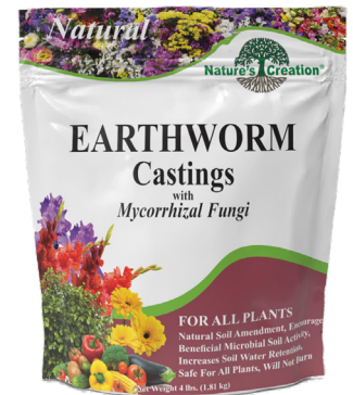
NC198 4 lb. 8-13958-02198-6 NC199 10 lb. 8-13958-02199-3