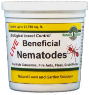
NC204 21,780 Sq. Ft. 8-13958-02204-4