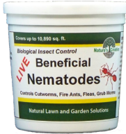
NC202 10,890 S. Ft. 8-13958-02202-0